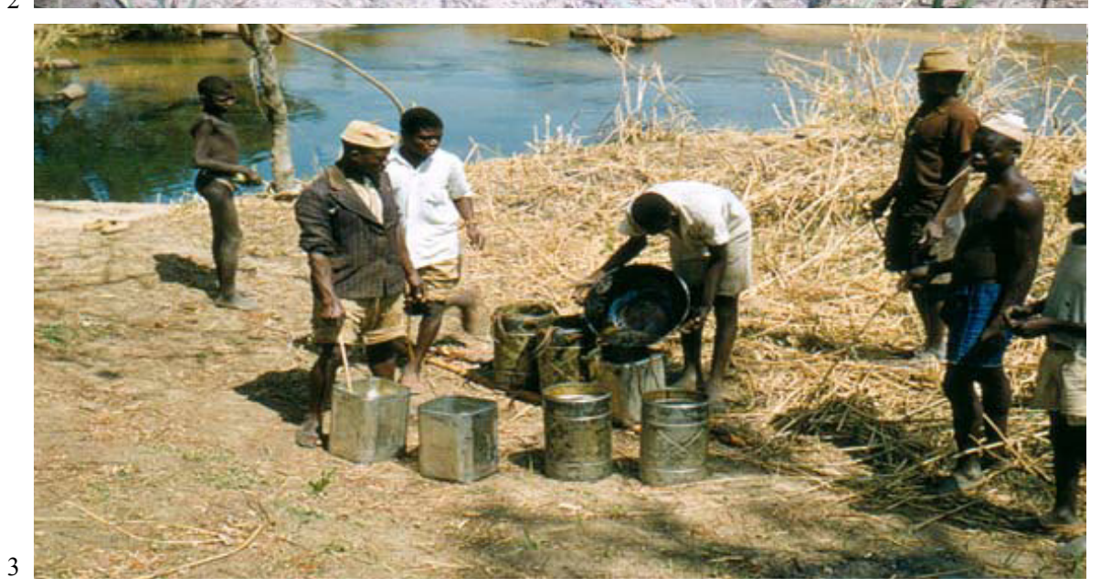
Plate 2. Preparing the DDT/Diesel oil mixture 1. Cook over a slow fire. 2 Stir gently. 3. Serve...